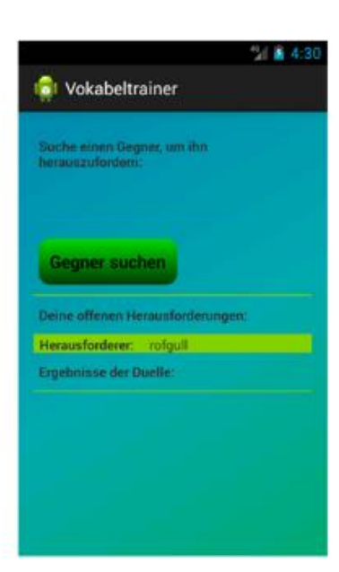
Figure 3: Vocabulary games: Hangman (right), word search puzzle (middle) and duel request (right).

More sophisticated possibilities are planned for the future. After entering the vocabulary, the words can be queried in both ways, foreign language to mother tongue and vice versa. Figure 2 shows on the right hand side a several choices for the translation of a German word. The user has to push on the button with the correct answer. Another possibility not shown in the picture is a text input where the user has to use the soft keyboard of the smart phone to enter the word. At the beginning of the vocabulary training, the user can configure how many times she will be asked for each word. The presentation of the words is random.