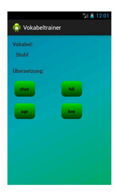
Figure 2: User interface for vocabulary input (left), display of synonym and pronunciation (middle) and query (right).

User data and vocabulary resources are located on a web server belonging to the system. User data are needed for personal achievements like high scores or group games. The vocabulary can easily be updated and changed for a whole class when it is stored on a server instead of the individual device. Furthermore an additional authoring interface can be realized for more powerful input devices.