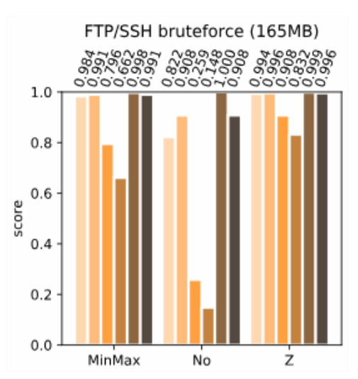
Figure 1: Sample result, full results available at https://gitlab.ilabt.imec.be/lpdhooge/cicids2017-ml-graphics.

On the whole, the tree-based classifiers obtained the best results for all attack types, on all metrics. Even a single decision tree is able to achieve 99+% on all metrics for the DoS / DDoS and Botnet attack types. Another interesting finding is that building the tree without scaling the features, improves the performance on all metrics for detection of the brute force and port scanning traffic, to be near-perfect. Results on the merged dataset reveal that identification across different attack classes works with equally great results to the best-identified classes. It should however be noted that good performance on the merged data set includes the attack classes with the most samples