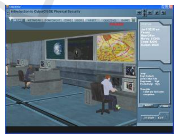
Figure 2: Screenshot of CyberCIEGE.

Another game is CyberCIEGE, a research prototype by the Naval Postgraduate School, which made it to the public and is available for download<sup>8</sup>. CyberCIEGE is setup as an interactive environment where players learn about computer and network security. The player acts as an employee of a company and is responsible for the configuration of firewalls, VPNs and other security related systems (see Figure 2). The game is more complex and provides different scenarios. Various attack scenarios include viruses, trojan horses, malicious email attachments and more. It also adresses more sufficient skills and knowledge in CS. It was used in various studies to evaluate its effectiveness (Ariffin et al., 2016; Irvine et al., 2005; Raman et al., 2014).