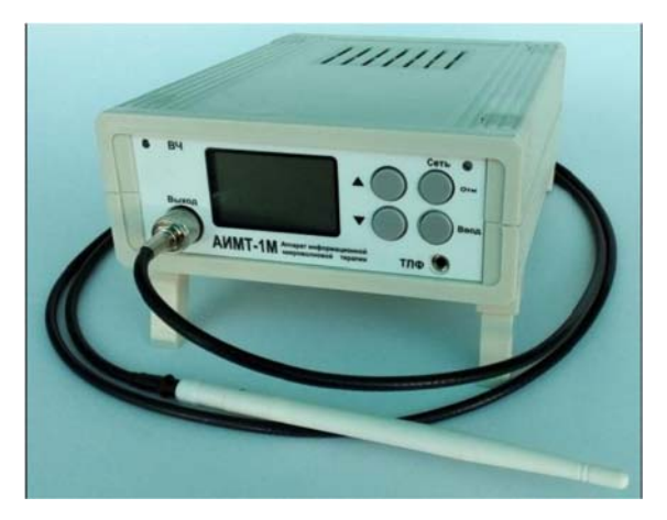
Figure 1: Device for simulating solar microwave radiation in the frequency range (4.0-4.3) GHz.