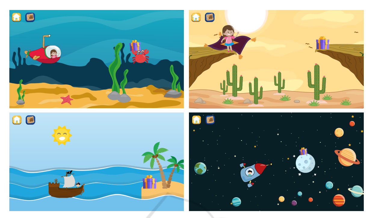
Figure 1: Some scenarios in the sustained vowel game.