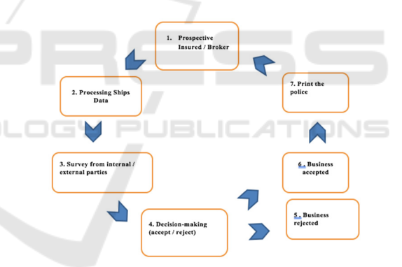
Figure 2: Stages in the Underwriting Process in a branch office and head office.

The underwriting process is valid when the sum insured of 1.5 billion, the branch office can directly perform underwriting at the branch office without having to request the process of underwrite from the head office