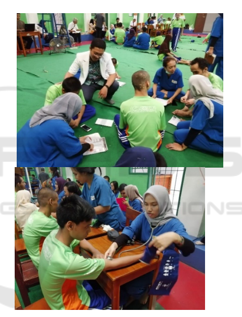
Figure 4. Documentation of Health Service Activities

workers. Positive perceptions are indicated by respondents' expressions stating that health workers speak kindly. 61% of respondents said they were delighted with the implementation of the health service program, and 31% said they were quite satisfied. The attitude of health workers who respond well to the community when giving an opinion gets a positive response that health workers can be good listeners at the time of counselling and are perceived as friends who are willing to listen to complaints about patient health problems. In general, patients' perceptions of health workers are excellent. Every health service activity of the officers always provides counselling to the community using persuasive language, and according to the respondents, it affects the increasing awareness of the community to implement a healthy lifestyle.