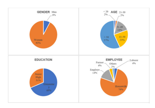
Figure 1: Respondent Profile.

grouped into focus in research discussions. The informant's education level is 69% of elementary school graduates and 31% of junior high schools with 76% professions becoming a housewife and 14% becoming workers with the remaining 10% being farmers, factory workers. The low level of education makes the majority of middle-aged women choose to work to take care of the household (Figure 1).