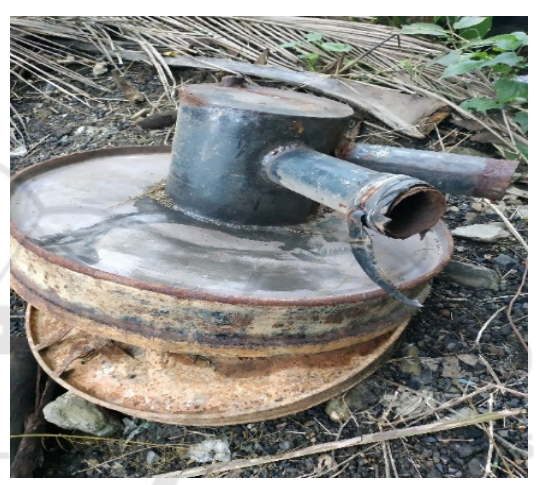
Figure 1: Patchouli distillation tool of central Meranti patchouli farmers.

Technology and machinery are important elements in expanding the scope of business. In businesses engaged in agriculture, the use of technology and machinery is absolutely necessary. Technology in agriculture can be used to predict climate and weather, while machinery can be used to streamline labor and time management before and after harvest. However, in patchouli farming in Meranti Tengah Village, the use of technology and machinery is still failing to be carried out due to the lack of technological understanding and inability to use machines or the price of machines that are too expensive.