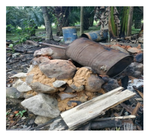
Figure 2: Patchouli oil receptacle drum containers.

By using machines such as Figure 1 and Figure 2, we can be sure that the yield from distillation of dried leaves will not get maximum results. The latest and sophisticated machine should be able to improve the distillation results because by using traditional machines like that is possible for the oil still contained in patchouli leaves will not come out perfectly. Therefore, the government's attention to patchouli farmers in the village of Meranti Tengah in terms of information assistance and the provision of distillery equipment is absolutely needed by farmers because based on the results of interviews, none of the patchouli farmers have ever gotten that.