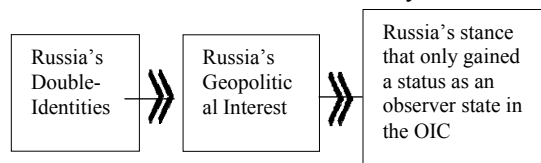
Figure 2: Diagram of the model of analysis

From the above operationalization of theories, this research will use a model of analysis as follows: