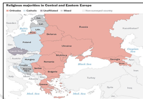
Figure 4: Deployment map of religious majorities in central and eastern europe - (Pew Research Center, 2017).

If referring to the classification of identities from Alexander Wendt, Russia on this case is seen to has two different identities. The first one is Russia as the largest Muslim population country in Europe and the second one is Russia as the largest Orthodox Christianity state in the world. Both religious identities cannot be denied as an integral part of Russia, either Muslim or Orthodox Christianity. This paper found that both reasons has giving a big impact to the Russian status in the OIC membership as an observer state.