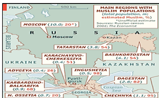
Figure 3: Deployment map of muslim majority area in russia - (Laqueur, 2009).

It can not be denied that Russia indeed has an internal political problem which way more important with their own Muslim communities than its relation with other Muslim states counter parts. The Russian government stance toward its Muslim minorities are filled with a number of contradiction which hard to avoid. Moscow are insist to always keep its loyalty to the Muslim minorities, however sometimes they hard to or does not want to fulfill the requests and demands from many Muslim elements. Meanwhile there are two area in the Volga region (the Republic of Tatarstan and Republic of Bashkortostan) which are one of the most important petroleum producing area in Russia. Both area has received a number of special autonomy policy, even they sparked an idea to require every Deputy of Russian Prime Minister or Russian President must be a Muslim from Volga region (Laqueur, 2009).