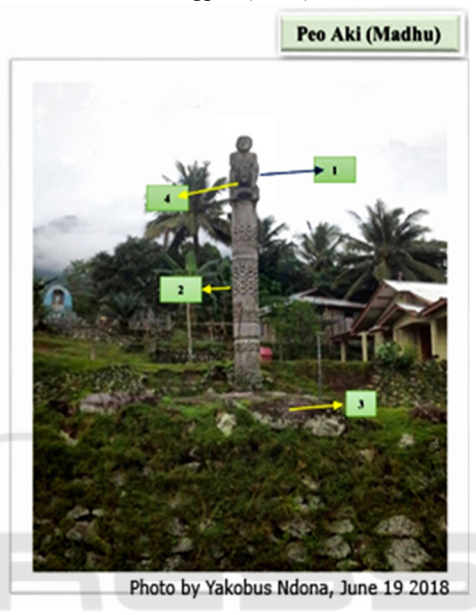
Figure 1: Peo Aki or Madhu. Peo aki has four basic elemen, namely pu'u Peo or Peo's base (number 3), toko Peo or Peo's pole (number 2), and ana jeo or the statue of naked man (number 1), with male genital (number 4).

base of the branch that describes the female genitalia, and earrings (uli wolo) on the East and West sides of the base branch, which emphasizes the feminism of Peo fai. On every side of the base of Peo fai, there are carvings of stars and earthly creatures (scales, centipedes, lizards and crocodiles). On the back of both branches, there are carvings of the palm leaves, and on the top of every branch, there is a statue of a magpie (koka).