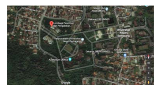
Figure 1: Location of the Prof. Dr. Retno Sriningsih Satmoko building.

water storage. Also has a solar panel system with 6 pieces of solar panel outside the building size 40 cm x 30 cm. There are 8 accumulators (batteries) with storage capacity 200 Ah / 12 V per accumulator (battery). 1 Inverter DC-AC with a voltage of 48 V. There is a system of fire extinguisher (free hydrant), Air conditioning system (air conditioning), CCTV (Close Circuit Television) and the central telephone.