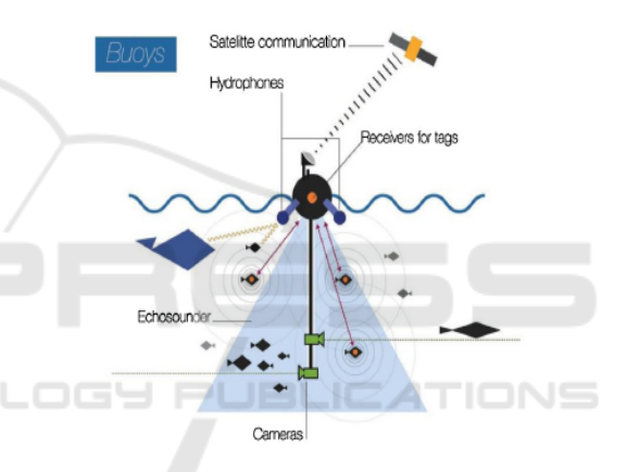
Figure 2: Concept of smart FADs.

This paper describes the investments, over and above the costs of construction and deployment, needed to optimise the use of nearshore FADs for improving access to tuna and other pelagic fish for the food security of rural_and urban communities in Indonesia Island countries and territories.