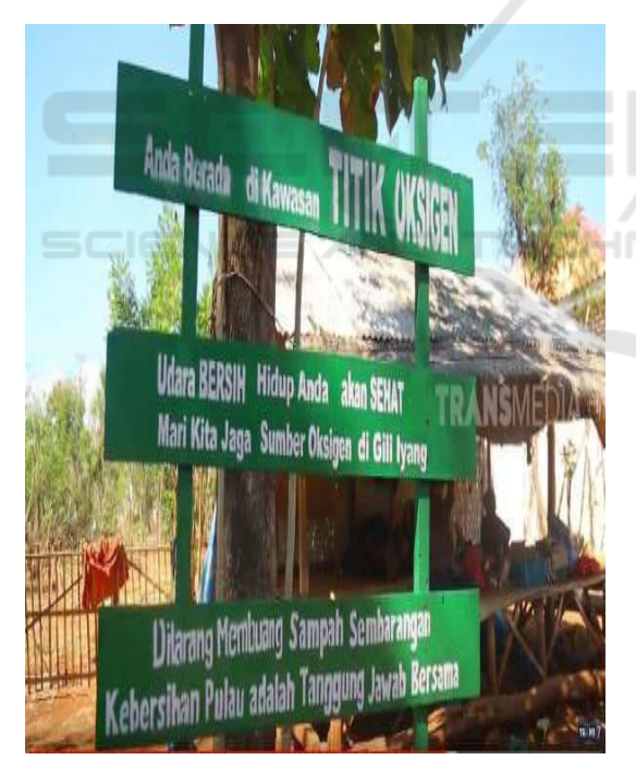
Figure 3: Titik Oksigen, an area with the highest oxygen content in Gili Iyang Island.