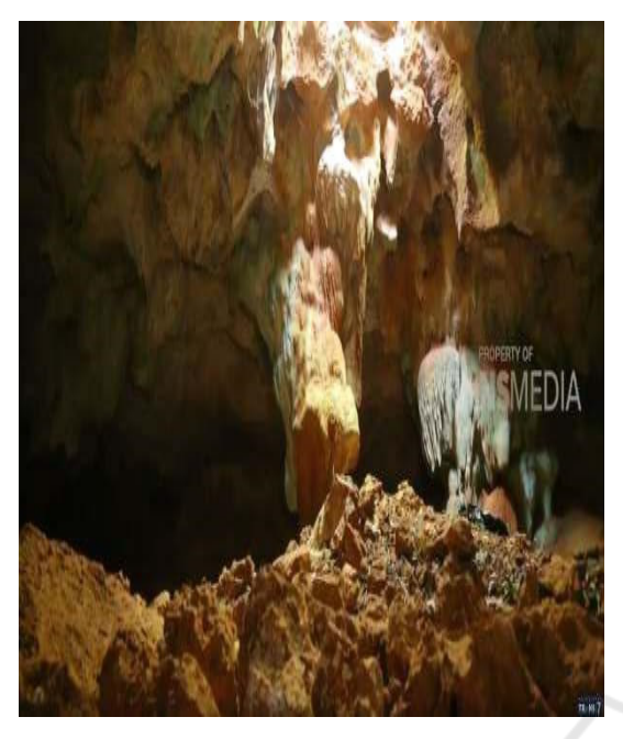
Figure 2: Goa Mahakarya, the beautiful cave in Gili Iyang Island.