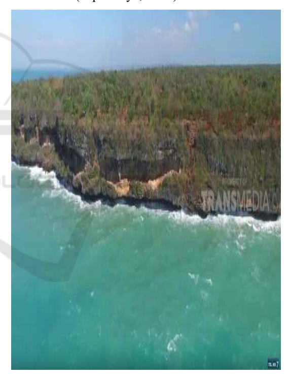
Figure 1: Batu Canggah, one of destination in Gili Iyang Island.

3.3 to 4.8 percent above normal. High levels of oxygen content is believed to be the cause of the majority of the population on the island Giliiyang young and still up in good shape, although he reached 90 years, even to 101 years. To arrived to the giliiyang island needs 30-45 minutes from Dangke Port by using a boat. In Giliiyang, visitor can enjoy some beatiful destination such as Batu Canggah, Goa Mahakarya and Titik Oksigen. Batu Canggah is a big stone that located in edge of beach. This stone is a refutation of the land around the coast. Goa Mahakarya is a cave that has beautiful stalaktit and stalakmit. In this cave some stalaktit can produce a sound. Titik Oksigen is an area, that has content of oxygen in the air higher than the other area in this island. Based on the references, the Ministry PU and Public Housing stated that the level of oxygen in Gili Iyang lowest in the range (20-23)%, and highest reaches 27% (Ciptakarya, 2014).