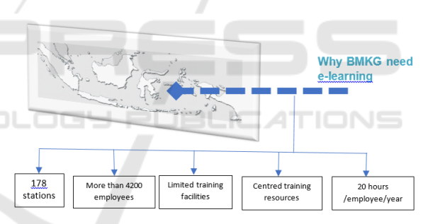
Figure 1: Implementation in PMG Ahli Training Course at BMKG.

Some researcher doing their research about online training, and have implemented in the technical training. So this research try to implemented the learning method through the online training/non classical training in BMKG named PMG Ahli Training Course. Based on the underlying problems above and because there have been no previous studies in our institution, it is necessary to conduct detail research detail about online education and learning strategy that affects the effectiveness and successful conduct of PMG Ahli Training Course in BMKG.