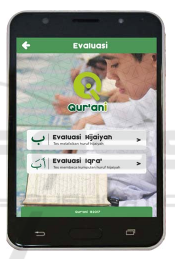
Figure 12: Menu item "Evaluation".