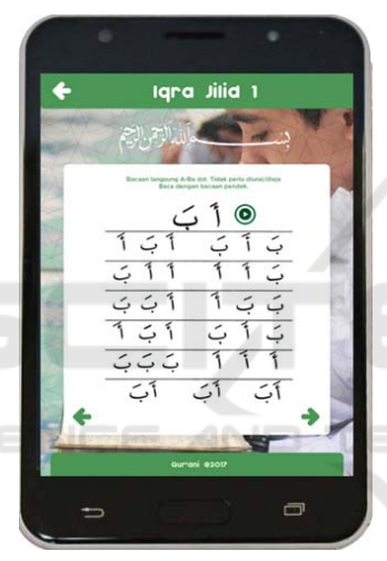
Figure 9: Menu item "Iqro" each part.