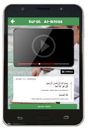
Figures 11: Menu "Juz Amma" with Video.