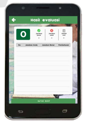
Figures 13: Result of evaluation.