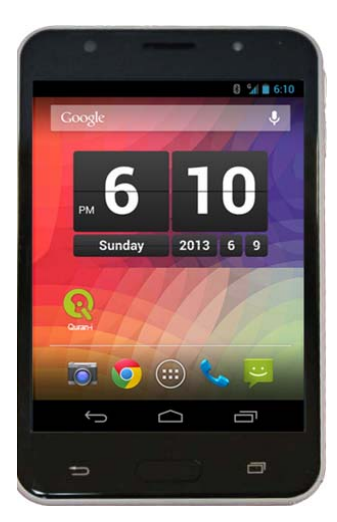
Figure 3: Icon.

For the menu item "Hijaiyah" (Arabic Letters), the letters alif to ya', which number to 28 in the alphabet, is shown in Figure 6, where children will choose one of the letters to learn, alif being one example. The "Hijaiyah" menu is very important, because learning of the Al-Qur'an usually begins by learning the basics of the Arabic alphabet, or the consonants and vowels that make up the text of the Al-Qur'an. With this content, children will learn how to pronounce the letters by tapping the microphone button, which will then show the word being pronounced can see in Figure 7. The content is also supplemented by sounds that play and hand signs in the form of animations that appear on the screen. This speech-to-text system can increase the accessibility for hearing-impaired children (Subhaashini et al., 2015). This system also allows the possibility for users to be able to interact with other people, including people with normal hearing, in a comfortable and efficient manner while using the application (Chiu et al., 2010).