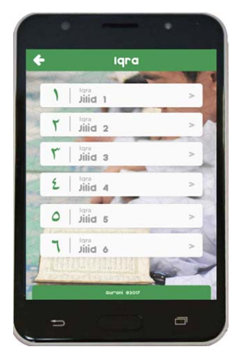
Figure 8: Menu item "Iqro".