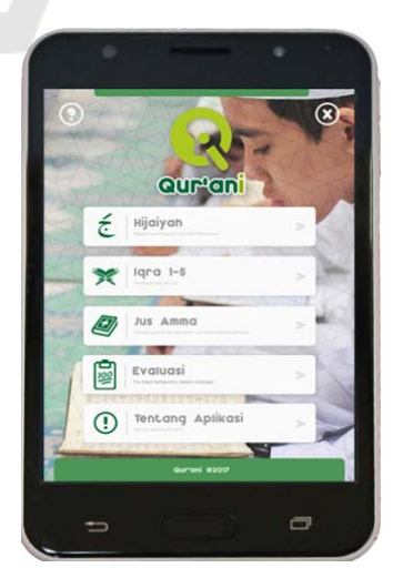
Figure 5: Primary screen.