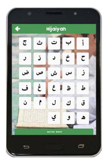
Figure 6: Menu item "Hijaiyah".