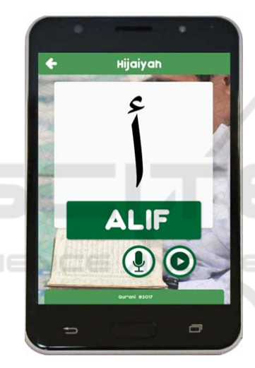
Figure 7: Menu item "Hijaiyah" is supplemented by microphone and animation.

For the menu item "Iqro" (Readings), this is divided into "part 1 to 6" in Figure 8 where children will pick the content of one of the parts of Iqro 1-6; each part contains approximately 30 pages in Figure 9. The Iqro content is supplemented by a system of sounds and example signing animations. Animations are an important aspect that must be considered in developing an application specially designed for children with hearing impairments (Adamo-Villani, 2007). Results of a research conducted by (Nathan, Hussain and Hashim, 2016) showed that children with hearing impairments need applications that are eye-catching to them, and one of the criteria is animation. With the presence of animation, children will become interested to learn more actively with this application.