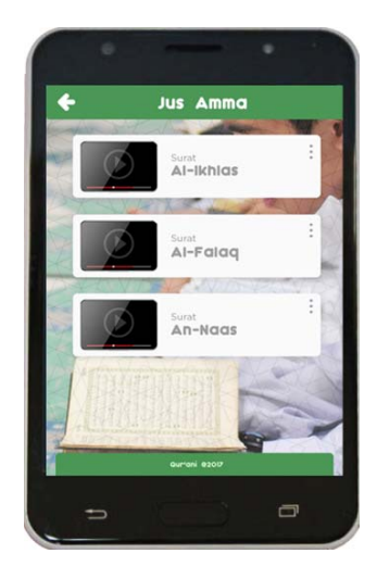
Figure 10: Menu item "Juz Amma".