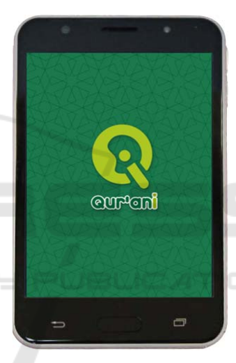
Figure 4: Splash screen.