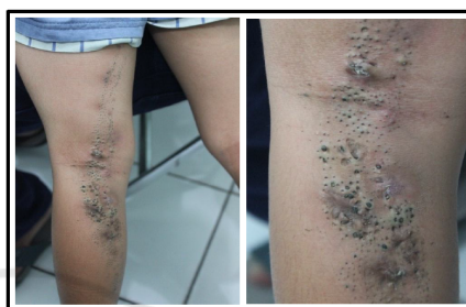
Figure 1. Nevus comedonicus on the back and left thigh. A cluster of firm, pigmented, protrude comedo-like papules in a linear pattern along Blaschko's line.

Nevus comedonicus is an extremely rare dermatological problem with an estimated occurrence of 1 case in every 45,000–100,000 individuals (Kaliyadan,2017). A study by Inoue et al., reported that there were only 200 cases until the year of 2000 (Inoue,2000). A retrospective study conducted in Mexico City from 1971 to 2001, among 417,511 paediatric patients, 443 displayed epidermal naevi, but only 5 of them diagnosed as nevus comedonicus (Vidauri,2004). There has not been any data about the prevalence or even the case report of nevus comedonicus in Indonesia so far.