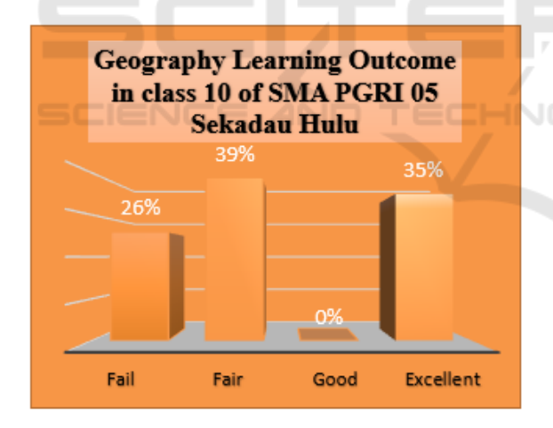
Figure 2: Geography learning outcome.

This study found that in SMAN 1 Sekadau Hulu, 9% of the students failed to pass the standard, 0% passed the standard fairly, 91% passed the standard well, and 0% of the students passed the standard excellently.