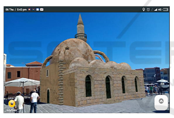
Figure 3: 3D reconstruction of the Glass mosque featuring the now demolished minaret, as seen by MAR users.

The main technical challenge was to visualize, onsite, the 3D reconstructions of monuments displayed on a standard mobile phone, merged with the realworld offering a location-aware experience. In this section, we present the final user interface of the application and the flow of the experience. Upon the activation of the application the user is welcomed in a splash screen and is requested to create an account or login with an existing one. After the login process, the application checks the location and requests the POIs and the historical information from the server while it transfers to the main screen. The map activity forms the main screen of our application and facilitates the core of the functionality as shown in Figure 4. POIs are displayed on the map in their corresponding geo-locations. By clicking on a marker, the user can see the info window of the POI containing information, a thumbnail and the distance between POIs.