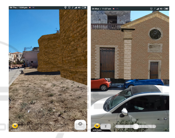
Figure 5: Reconstructions of the demolished towers of the Byzantine Wall and the restoration of the Rocco temple.

The Camera View displays the real-world content as 2D labels, which contain basic information about the POIs and displays them as dots on the radar to assist in navigation. By clicking on a label, a bottom drawer appears which holds additional information and allows for more interactions. Users can save the POI for later reference, access the reconstruction if available, or return to the map. The main concept of the experience is to reveal the available information under controllable conditions, to facilitate a diverse range of textual, image and 3D interactions.