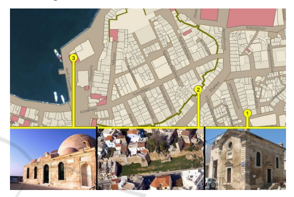
Figure 1: The Glass Mosque (left), the Saint Rocco Temple (right), the Byzantine wall (middle).

historic sites and enable visitors to see them integrated with their real environment, while using a sophisticated AR mobile tourist guide. We aim to deliver geo-located information to the users as well as calculate accurate registration positioning between the real-world monument and 3D digitisations, while users document their visits. By integrating digital maps and a location-aware experience we aim to urge the users to further investigate interest areas in the city of Chania, Crete, and uncover their underlining history by exploiting cutting edge AR mobile technologies.