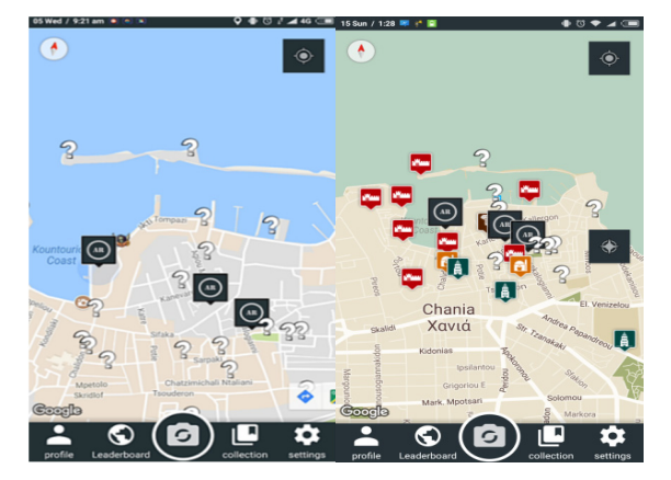
Figure 4: Map view displaying the POIs.

By interacting with a bar at the bottom of the screen, the user navigates the app. These include user profile and preferences, leader-boards and the library while a round button placed in the middle is used to swap between map and camera navigation.