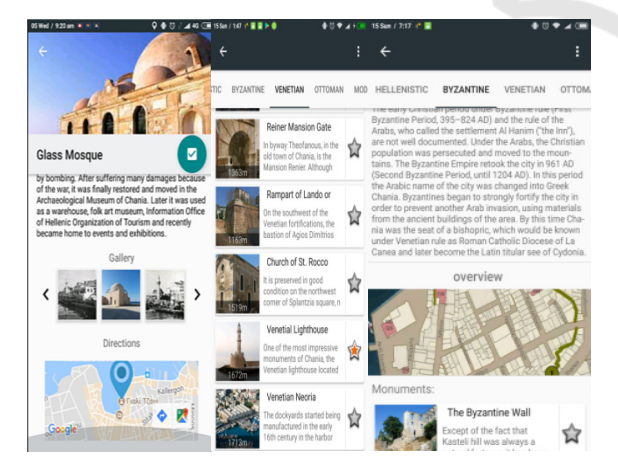
Figure 6: Pager View of Library, Monument details page.

The Library page is where a collection of the historical information is displayed (Figure 6). It consists of a view pager containing the historical periods in chronological order. Each page includes a historical briefing and an image showing the active area for that period as well as a list containing the monuments that have been correctly classified. The locked monuments are contained in a separate list. The users can see the monument-specific information by selecting the items on the list. The user can also acquire historical information, including text and images, mark and save monuments or get directions to specific locations.