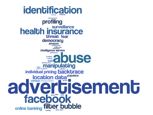
Figure 2: Word cloud of perceived threats to online privacy. Font sizes reflect the frequency of mentions.

But most participants also use a rather straightforward approach by trying to avoid the generation of data in the first place ( data avoidance ). Services that are well-known for collecting a lot of data are not used, the GPS signal of the smart phone is switched off, and only information that is essential is provided in online forms (e.g., the address for online purchases).