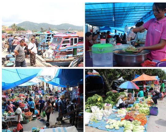
Figure 5 The Atmosphere of Onan Balerong Balige.

Every Friday is called Onan Day . The city center becomes very crowded because of many people who come to this area. They do for selling, shopping, gathering, even travelling. The crowd of sellers and buyers do not only focus on the center of the Balerong complex, but scattered around the buildings, on the sidewalk shops and along the left and right side of the road as far as 1.5 km, starting from Jalan Sisingamangaraja up to the port of Balige ( Figure 5). The community call Onan as Balige bolon ( bolon means: big, great), because so many sellers come to the market comparing to other markets.