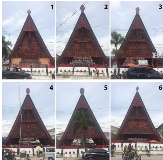
Figure 2 Onan Balerong Buildings

This building was built by the Dutch Colonial in 1938. The architect designed those as meeting halls, entertainment centers and Batak Opera performance center. But in 1942, the function later turned into a traditional market. This happened through the desire of the Batak kings who appointed Balerong as the center of the market, because of its strategic location in the city center. The accessible location from surrounding area so make it easier for communities to visit (Figure 3).