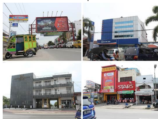
Figure 6 The Atmosphere around Onan Balerong Complex

The existence of Onan Balerong that stand on the Jln. Sisingamangaraja become the landmark of Balige until recently. It presents the characteristic, identity, and the existence of Balige. Its performance captivate people. It is a melting place of local and modern activities. The events take place naturally without any conflict