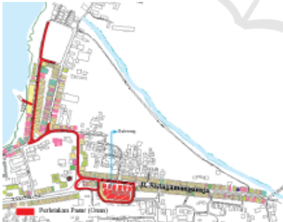
Figure 3 Location of Onan Balerong.

This building was built by the Dutch Colonial in 1938. The architect designed those as meeting halls, entertainment centers and Batak Opera performance center. But in 1942, the function later turned into a traditional market. This happened through the desire of the Batak kings who appointed Balerong as the center of the market, because of its strategic location in the city center. The accessible location from surrounding area so make it easier for communities to visit (Figure 3).