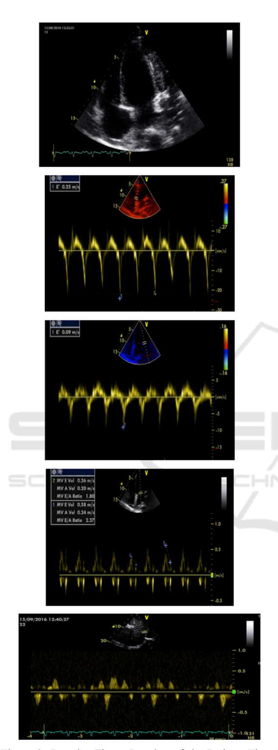
Figure 3: Doppler Tissue Imaging of the Patient. The e' medial velocity was 25 cm/s and the e' lateral velocity was lower (9 cm/s). There was an increase in the difference of mitral flow rate during inspiration and expiration > 25%. There was also an increase in backflow of diastolic hapatic veins at expiration.

Treatments of this patient were bed rest, O2 2-4 L/min with nasal canule, IVFD NaCl 0,9% 10 gtt/min, Cefotaxime 1 gr/8 hours/i.v, Gentamicin 120 mg/12 hours/i.v, anti-tuberculosis first category drugs (Fixed Dose Combination) 1x3 tab, prednisone 3x20 mg/oral, furosemide 1x40 mg/oral, paracetamol 3x500 mg/oral, vitamine B6 1x2 tab. There was clinical improvement after treatment for 14 days and the patient can get outpatient control.