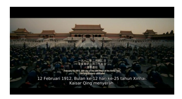
Figure 13 Qing Emperor surrendered (01.47.05)

February 12, 1912, the 12th month of the 25th day of the Xinhai year. Qing Emperor surrendered.