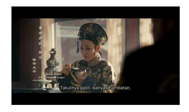
Figure 18 Dowager Longyu (45.07)

Li Yuanhong is played by Jian Wu. Li Yuanhong is a supporting character / role in this film.He is a Commander of the 21st Mixed Forces.He was a Commander of the Dynasty.After the rebellion in Wuchang, he was detained by the revolution.