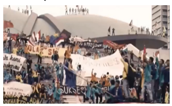
Figure 2 the change of government system (58.44)