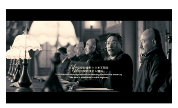
Figure 10 Yuan Shikai secretly agreed to establish the Republic. Negotiations resumed (01.23.06)

In early November, after success in the Wuchang rebellion, HuangXing led the attack on Hankou