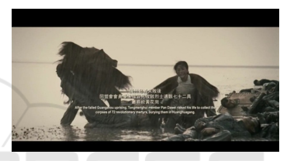
Figure 6 collect the corpses of 72 revolutionary martyrs, burying themin Huanghuagang (24.56)

April 27, 1911, day 29 of the 3rd month of the Xinhai year.Guangzhou Governor's House.