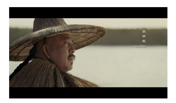
Figure 19 Yuan Shikai (35.45)

Empress Dowager Longyu is played by Joan Chen Longyu Dowager is an antagonist in the 1911 film, and is the Empress of the Kingdom of the Qing Dynasty.He finally decided to send Yuan Shikai to take over the battlefield.Where she finally resigned because of Yuan Shikai.