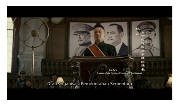
Figure 11 the provincial representatives voted (01.28.08)

South.Yuan Shikai would not negotiate without instituting constitutional monarchy.Talks were at a stalemate from the beginning. After that, Yuan Shikai secretly agreed to establish the Republic. Negotiations resumed.