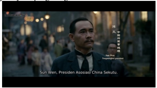
Figure 15 Sun Yat Sen (06.06)

Tongmenghui, Sun Yat-Sen's alliance for democracy, founded 1905, become the Guomindang in 1912 Huang Xing (Keqiang) is played by Jackie ChanHuang Xing, or more familiarly called Keqiang By Yat-Sen is a Commander of the Tongmenghui or Revolutionary forces to liberate China from the Qing Dynasty. Keqiang is a good friend of Yat-Sen.