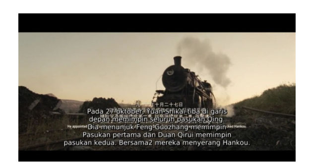
Figure 8 arrived at the forefront of leading the whole Qing army.He pointed to Feng Guozhang leading the first Army (45.33)

On October 27, Yuan Shikai arrived at the forefront of leading the whole Qing army. He pointed to Feng Guozhang leading the first Army and Duan Qirui leading the second army. Together they attacked Hankou.