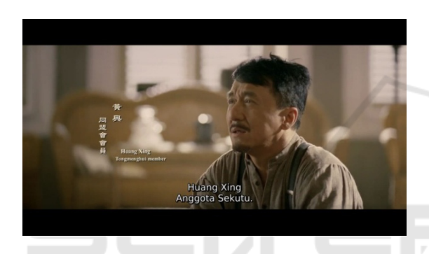
Figure 14 Huang Xing (06.06)

February 12, 1912, the 12th month of the 25th day of the Xinhai year. Qing Emperor surrendered.