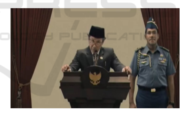
Figure 30 B.J. Habibie (35.17)

Amoroso Katamsi as President Soeharto is a well-groomed, courteous and charismatic person. He played the role of president Soeharto he was very calm, and full of charisma .Here the role he played is very central because he is the object to be descended .He characterized Soeharto well, one of them a polite style of communication to state officials and public figures .Until the end of his power he still can play a nice attitude with good.