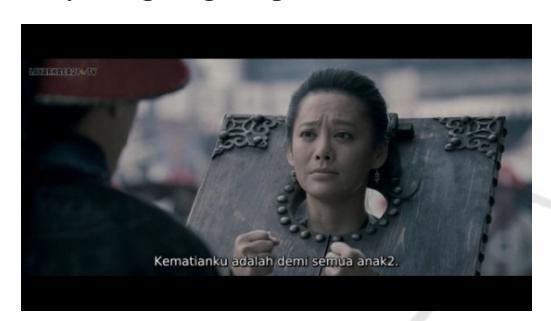
Figure 3 Revolution is for the people of the world to be able to rebuild a family worthy of them (02.46)

Qiu Jin: "My death is for the sake of revolution." Revolution is for the people of the world to be able to rebuild a family worthy of them. "" Death is not without fear.