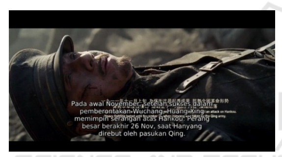
Figure 9 success in the Wuchang rebellion (01.06.34)

On October 27, Yuan Shikai arrived at the forefront of leading the whole Qing army. He pointed to Feng Guozhang leading the first Army and Duan Qirui leading the second army. Together they attacked Hankou.