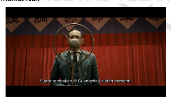
Figure 4 The rebellion's failed (16.38)

Qiu Jin: "My death is for the sake of revolution." Revolution is for the people of the world to be able to rebuild a family worthy of them. "" Death is not without fear.