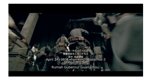
Figure 5 fight for freedom (08.39)

Sun Yat-Sen: "The audience of this fundraiser ... Actually is to conduct an uprising in Guangzhou, but recently ... I received the news ... The gunshots in Guangzhou have stopped. The Telegraph officer said ... The rebellion's failed.