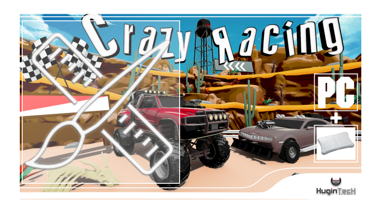
Fig. 4. Crazy Racing screenshot.