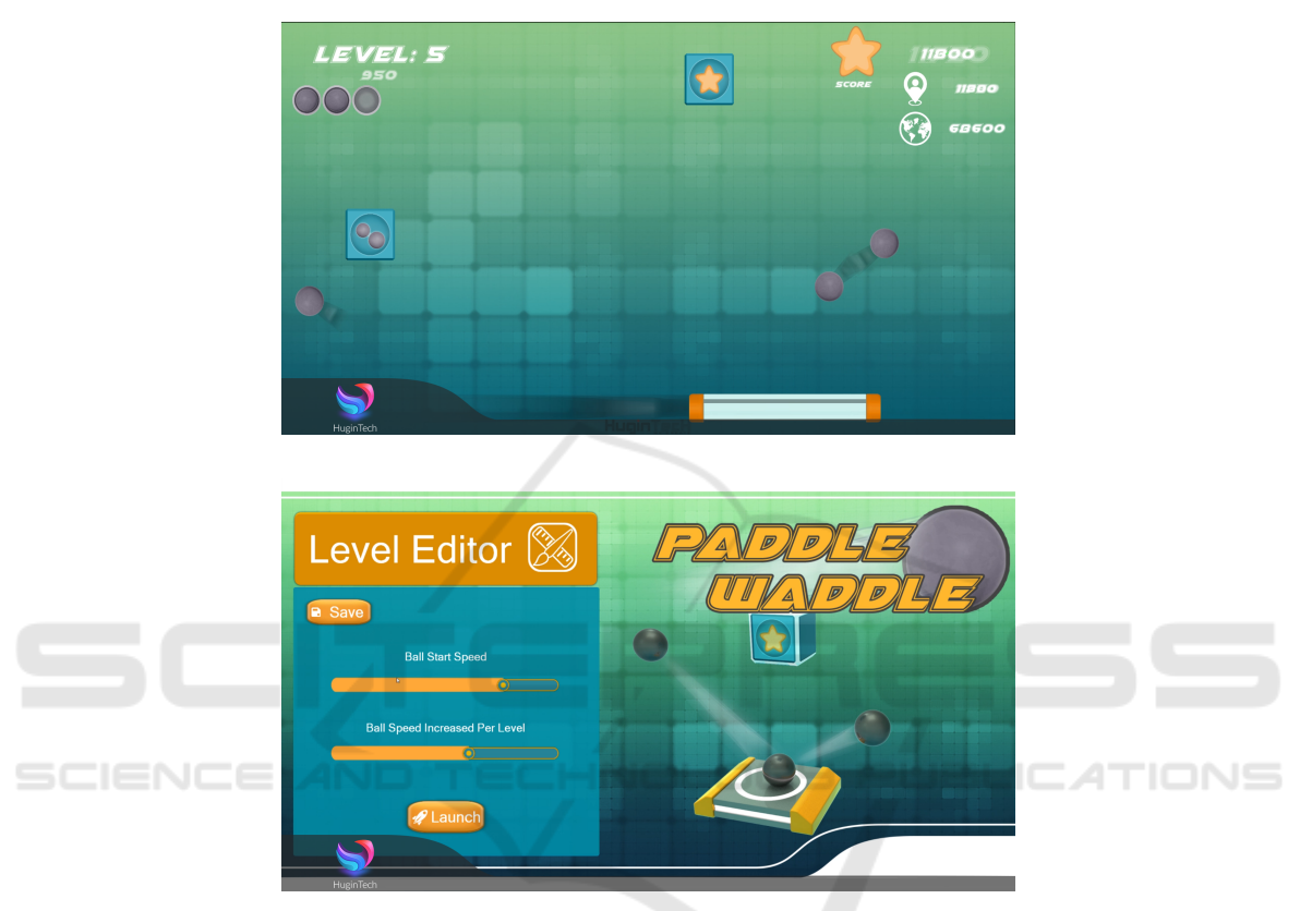
Fig. 1. Screenshots of Paddle Waddle and its level editor.

The Paddle Waddle level editor allows you to set your own parameters for the game. You can control various settings such as ball speed and speed increase when reaching a new level. You can share the newly created level with your friends.