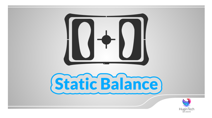
Fig. 6. Static Balance Test Game.

game. From a statistics perspective, social inclusion and education are latent variables of the data that are related to the game score. For example, a game that is mainly played using the body motions teaches the patients to improve their motor functions. Consequently, the game score of a patient is improved during time by playing this game, we can imply that the motor function of the patient is improved as well.