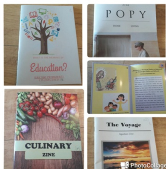
Figure 1: Students' zine project.

The genre-based approach in this research was implemented to facilitate the students to be able to construct their own Explanation, Analytical Exposition, Hortatory Exposition, News Item, and Review texts. These genres were given in 14 meetings in one semester, each of which was discussed in two to three meetings. As for the final project of the course, the teacher asked the students to write five texts individually and compile them as a zine. The following are some examples of the students' zine: