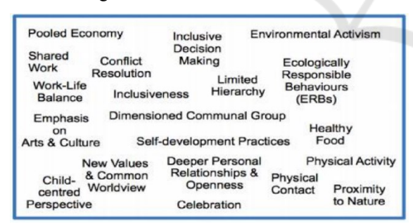
Figure 1: Important Element of Ecovillage (Hall, 2015).

Similarly, Kasper (2008), that the ecovillage should reflect the activities of the population, valuable communities of spiritual, social and ecological. Also, added by (Kasper, 2008) that in addition to these three things are more important things to be identified associated with zoning for agricultural management, sale (market) and settlements. In addition, it should be ensured the availability of various facilities that can be shared by the whole community. As well as meeting halls and places for recreation. This is important to increase employment opportunities and social interaction in the community. For research purposes, ecovillage is part of human interaction with the environment, especially on matters related to the socio-economic factors. More detail again (Hall, 2015) explains that in an ecovillage, must have a main element 21, as shown in Figure 1 below: