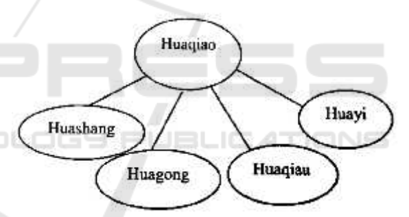
Figure 1: Classification of Chinese migrant.

Chinese migrants from China are usually called Huaqiao ( huakiao ) can be grouped into four groups, namely Huashang (Chinese traders), Huagong (workers, laborers and landless peasants, unemployed), Huaqiau (group of immigrants wishing to change their fate), and Huayi , Chinese descendants who have lived for a long time and gave birth in Indonesia.