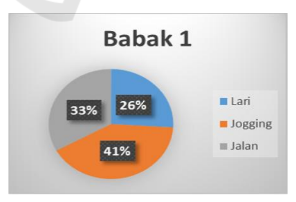
Figure 1: Percentage of running activity, jogging and futsal team of UPI Antam Bandung round 1.