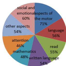
Figure 1: Teachers' understanding in the identification of children with learning disabilities.