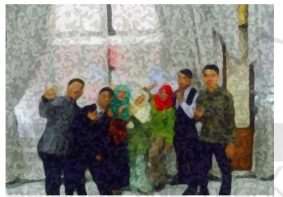
Figure 4: BFS propinquity with his close friends.

The high masculine and feminine characteristics in BFS make him androgyny. Androgyny individuals will live more happily and can adapt the surrounding s more easily compared to individuals with one dominant gender characteristic. This result confirmed Martin and Gnoth (2009) stating that androgyny man can act and behave appropriately based on certain social contexts. In figure 4, there are the BFS propinquity with his close friends.