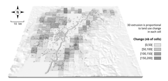
Figure 1: "Landscape sprawl" scenario: land use changes simulation in 2038.

The main idea of the "Landscape Sprawl" (LS) scenario is that future residential preferences will favor natural landscapes and rural amenities, as well as relative proximity to slightly dense urban areas (villages).