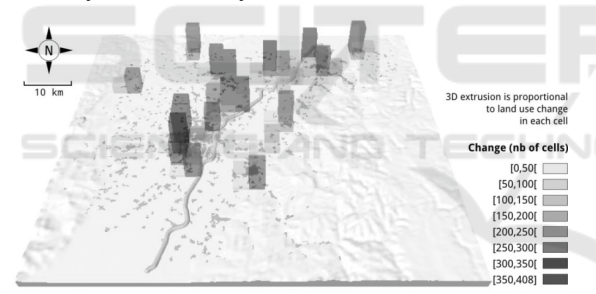
Figure 2: "Urban densification" scenario: land use changes simulation in 2038.

The main idea of the "Urban Densification" (UD) scenario is that future residential preferences will favor dense urban areas, close to urban amenities (e.g. parks, sport and leisure facilities), but relatively far away from industry and related nuisances.