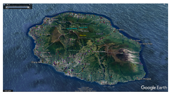
Figure 4: An example of results display on Google Earth.

and (Čertický et al., 2015) show that having a spatialized display of the simulation metrics in an earth browser such as Google Earth can be interesting. It gives the possibility to replay a previous simulation run, particularly useful for validation by domain experts. Indeed, recording a model as a video preserves the movement, but removes inspection capabilities. Moreover, it is then difficult to include the animation in web applications and to layer it with other spatial data sets. To address this, an export mechanism which records the simulation and its metrics and exports it to KML format is developped. It allow to incorporate data in displays using an interactive geobrowser. This export function can be used to create a web interface showing the output of a simulation run and the variation in the time of the metrics across different parts of the simulated area. An example of display is shown on figure 4.