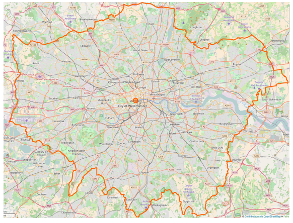
Figure 2: London map.

Reunion Island (Figure 3) is a French island sit-