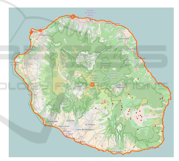
Figure 3: Reunion Island map.

uated in the south hemisphere, in the Indian Ocean, nearby Madagascar and Mauritius. It is an oceanic island of 2,512 km^2 , with a tropical climate and populated by 843,529 inhabitants (in 2015).