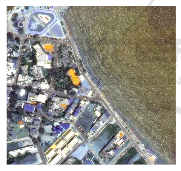
Figure 2: The coast of the satellite image in 2016.

In our approach we discuss the land use planning and control laws for a sustainable development of coastal regions for tourists. The current paper will focus on the coastal zone of Georgioupoli and its vulnerability as a result of the lack of spatial planning. The case study is selected because it concentrates the characteristics of a typical coastal touristic zone, which faces rapid intense unplanned touristic expansion. The examined zone has been diachronically influenced by the liberalization of construction regulations, an unqualified private sector emerged, hastily developing construction