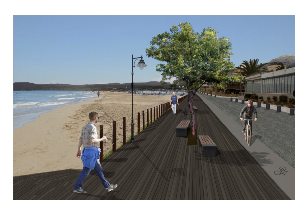
Figure 5: The new lanes according to the proposal.