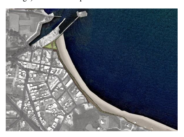
Figure 3: The coast with the beach nourishment and the green area at the end of the beach.

the existing buildings, an oblate pavement, with a total width of 2 meters is constructed. The pavement will be at the same level with the street and will be separated using short stanchions (Fig. 4). Today in the existing situation, a two-way, 7 meter wide (on average) street existed parallel to the beach.