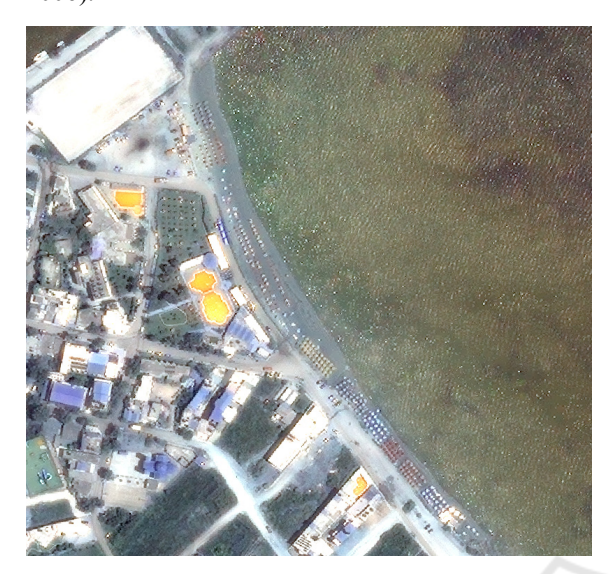
Figure 1: The coast of the satellite image in 2003.

is a soft engineering solution (Phillips and Jones 2006).