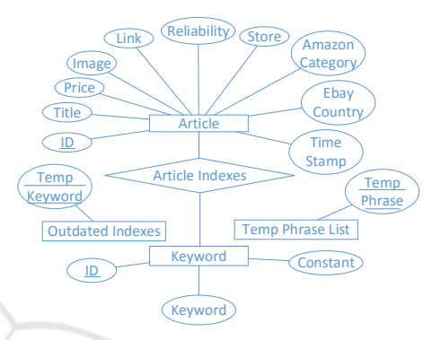
Figure 4: Entity Relationship model.

The model of database storage that we have chosen is relational database model (Figure 4). The reason that we have chosen this model is that because it creates indexes for fast access by using key constraints. We have decided to implement numeric identifiers for both articles and index terms (keywords) because the search for numeric values is way faster than text search.