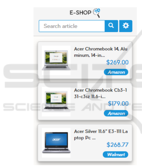
Figure 8: Search result page for query "acer laptop chromebook".

In this case the total time spend from request to response visualization is about 146.96ms and the top three results are shown on the Figure 8Figure where we see that the results are accurate.