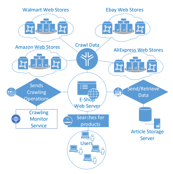
Figure 1: System architecture.

Below is listed the physical model of the system and the interactions between its components (Figure 1).