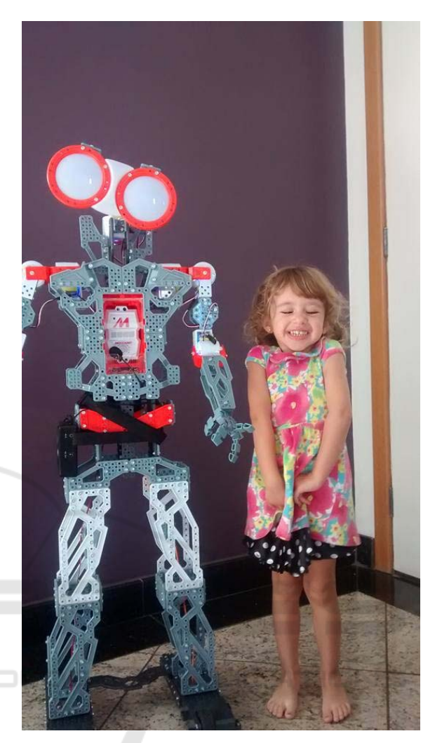
Figure 1: MeccaNoid G15KS, a humanoid robot 122 cm tall, it is programmable and respond to voice commands.

Once the purpose of Ozires it was to improve healthcare workers compliance with handwashing, he received an automatic alcohol dispenser that it was used as a support for cell phone (Figure 3). Cell phone is used to produce talking's about hand washing, the WHO five moments for hand hygiene (WHO, 2006), specific information of the hospital hand hygiene rate compliance, and other brief and simple messages, that are more likely to increase handwashing compliance (Taylor, 2016).