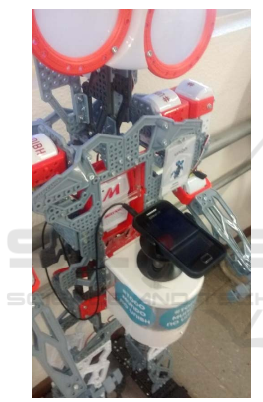
Figure 3: Ozires received an automatic alcohol hand sanitizer dispenser and a cell phone. All lessons given by the robot are produced in the cell phone by using a "change voice app" that produces robotic voices.

Besides speeches from the cell phone, modified by using change voice software to produce robotics voice, allied with movements programmed using the Meccanoid LIM<sup>TM</sup> programming, Ozires was adapted with a mini projector to show video lessons and a kind of spy camera, to record people reaction when watching him (Figure 4). Instead of to use the original audio output, an audio amplifier was installed directly from the Mecca Brain, to produce better sounds (Figure 5). It is amazing how adult and children react when Ozires is "alive" (Figure 6).