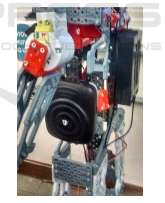
Figure 5: An audio amplifier was adapted to improve the speeches of Ozires. The original sound of the robot is a little bit noisy and it is not good enough to be used in crowed rooms.