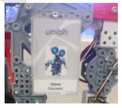
Figure 2: Ozires and his educator' badge from UniBH. This simple detail reinforces the educational character of the robot.