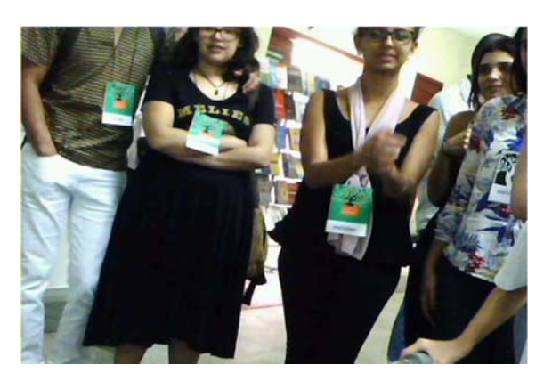
Figure 6: Photos taken by Ozires spy camera showing adults reaction during first contact with him. The robot attracts attention everywhere it goes!