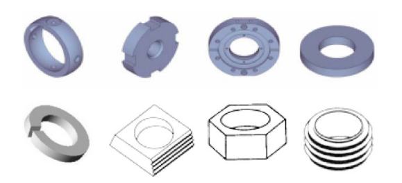
Figure 1: The top row shows a gimble ring, a lock nut, a flange and a washer (from left to right), which have a similar shape but a different classification according to their function. The bottom row shows several washers (spring lock washer, regular washer, hexagonal washer, knife-edge washer; from left to right) with same name but different shapes.

In engineering, it is conservatively estimated that