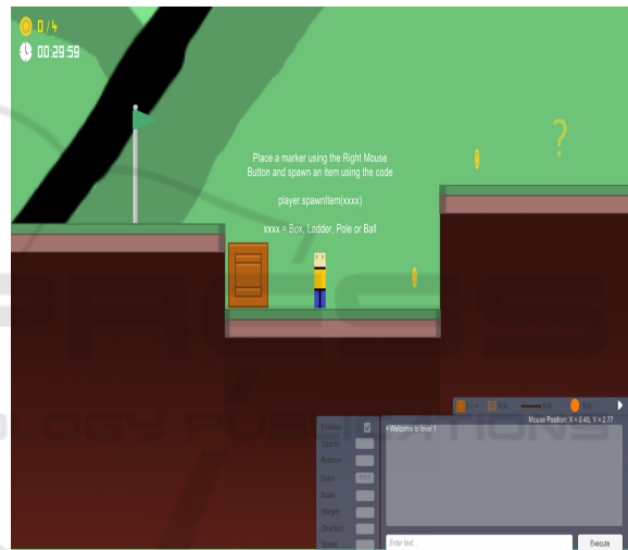
Figure 1: RunJumpCode Level 1.

Although hints are available, it is not free to use them. The user loses some marks for using hints. This helps to discourage the player from using them and guides them more towards thinking and independent learning. Both of which are again quite important for software developers.