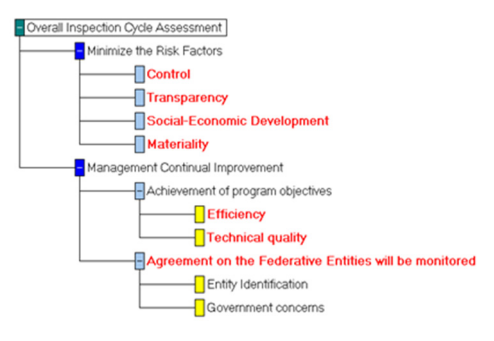
Figure 4: Value tree for an inspection action built with M-MACBETH.

increasing specification (Bana e Costa, 2001; Bana e Costa et al., 2004). In Figure 4 we present a value tree with the fundamental objectives to be attained with an inspection action. For instance, the "Management Continual Improvement" objective is concerned with the assessment of the inspection program's objective component in terms of efficiency and technical quality as well as the agreement on the entities and the areas to be audited.