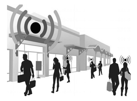
Figure 4: Street Web marketing.