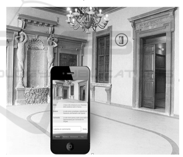
Figure 3: Street Web in a Smart Museum.

Figure 3 deals with a Smart Museum scenario, where Street Web may support the interaction between museum visitors and artworks. The system uses Beacons, deployed in the museum environment, and NFC Tags, storing data on the corresponding artwork, to deliver information based on proximity and to help visitor navigate through the museum to look at the artworks they most want to see.