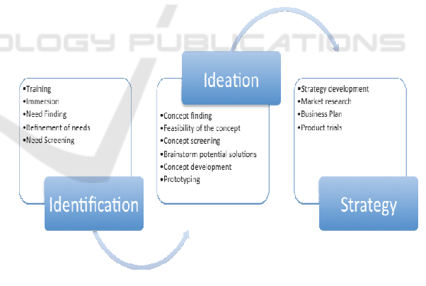
Figure 1: Proposed model version 1.

Analysing the findings from the hospital study key themes were identified. The results indicate that some aspects of Kotter's change model is useful to successfully manage change but would need to be modified for a healthcare context. This case study facilitated analysis from a hospital perspective and the findings informed and enhanced a proposed model which is called the Healthcare Innovation and Quality Change (HIQC) Model (See Figure 1). The HIQC model is split into three relevant sections which acknowledges that change occurs through key iterative processes namely identification, ideation and strategy. These three phases are similar to the phases in the innovation research fellowship. Each phase comprises of a number of requirements and practices which emerged from the research.