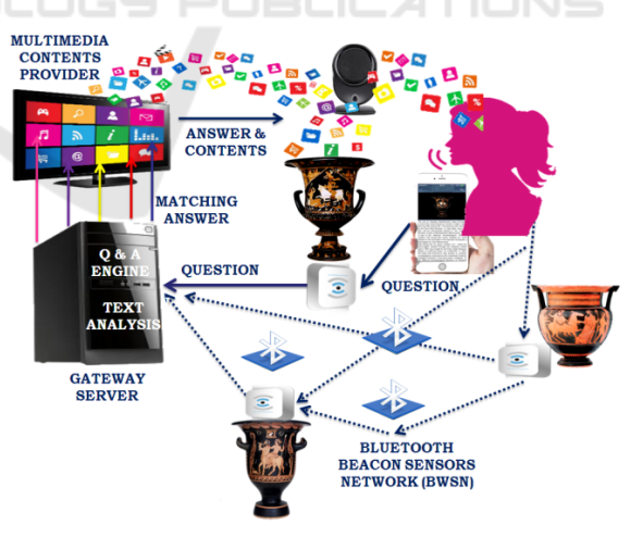
Figure 3: Service System Architecture.

A functional overview of the system architecture supporting the Speaking Things environment is shown in Figure 3.