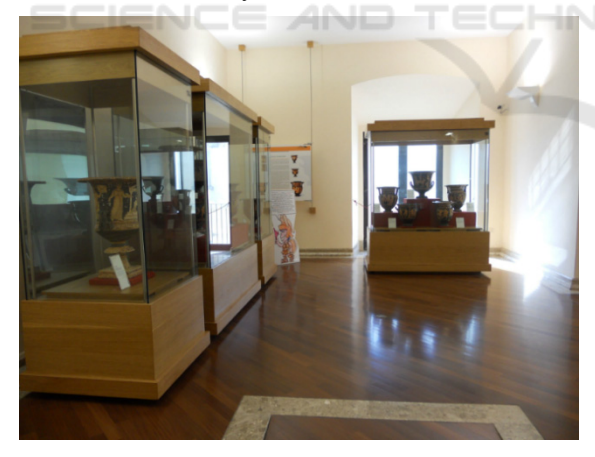
Figure 5: The National Archaeological Museum of Sannio Caudino artworks layout.

Overlapping areas were also managed by taking into account the movement direction of the users. A user localized in an overlapping area covered by two different beacons and standing at the same distance from each of them, will be notified by the beacon that has been detected after in the timeline of the user's path. In other words, the winning beacon is the most recent one detected by the user's device.