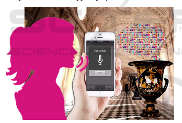
Figure 2: Speaking Things and Humans Interaction.

Some bookmarks to skip parts of the art object story telling are suggested to users in a "magic words" list, provided on the App display.