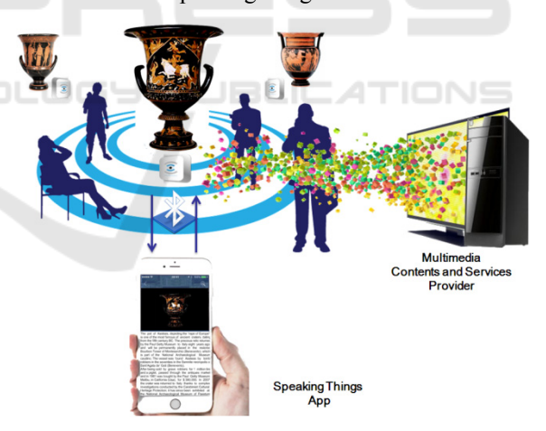
Figure 1: The Speaking Things System Environment.

Figure 1 shows, at a glance, the described environment of speaking things.