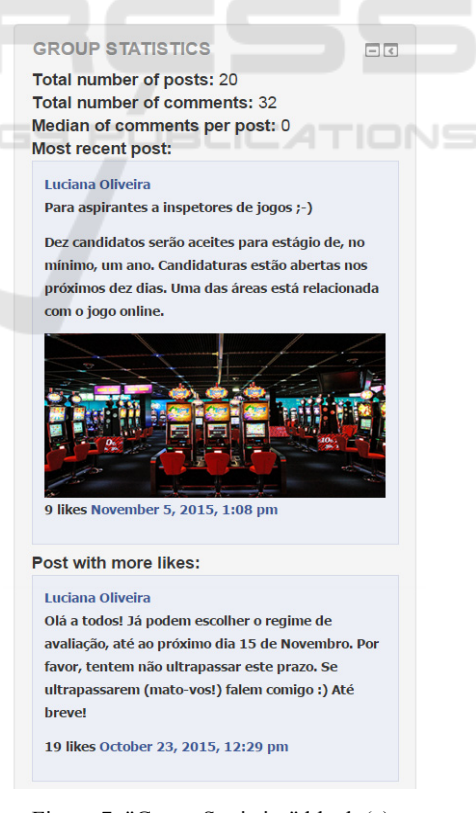
Figure 7: "Group Statistics" block (a).

For instance, a user may post a lot of messages in the group, but may not receive feedback at all (that is, the content may not be relevant for that community) and / or may not interact at all with other users