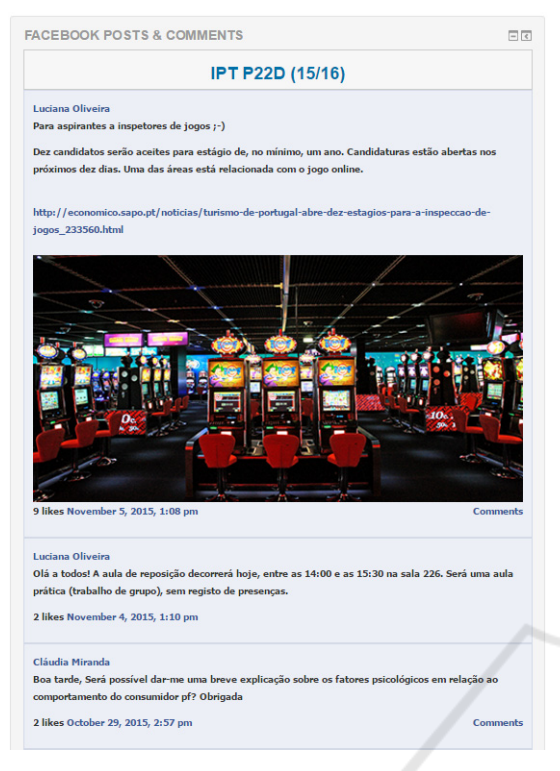
Figure 5: "Facebook Posts and Comments" block.

For each post it is possible to access the post author, post date, time and post comments. For the sake of economy of page height, comments are collapsed by default, and can be further expanded by the user, as illustrated in Figure 6.