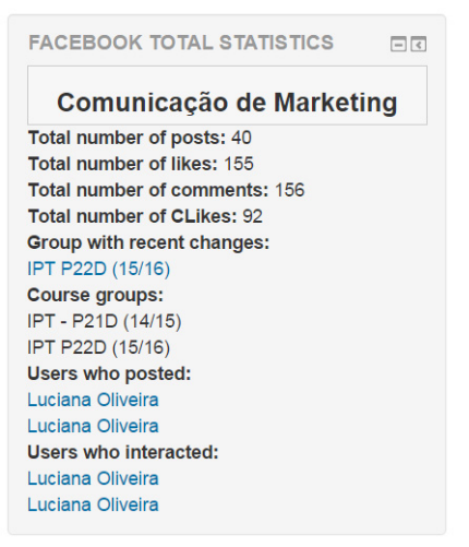
Figure 9: "Facebook Total Statistics" block.

Figure 8: "Group Statistics" user's interactions section (b).