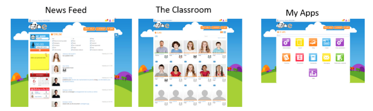
Figure 2: Interfaces for the pages « News Feed » « The Classroom » and « My Apps » in the VLE One.

When we were conducting our study, the VLE One had not yet offered services such as the Planner notebook and the Multimedia notebook.