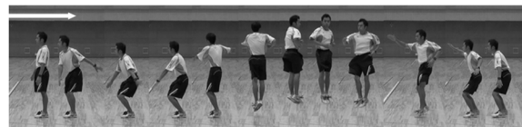
Figure 1: Jump with full turn (360°).

phase in a back tuck somersault influences the duration of the flight phase (Heinen and Vollmer, 2014). Heinen et al., (2012b) also reported that there is a relationship between visual spotting and movement when performing high bar dismounts; for example, fixations during the preparatory giant swings are correlated with flight distance during dismount. There is an interplay of eye-head movements with gaze displacement and body movements even while executing whole-body rotation without a jump