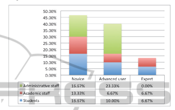
Figure 1: User survey question: "How would you evaluate your experience with reporting tools in general?".

given in a free form, and sorted and classified. There are two groups of feedback: the one that gives a subjective rating to report execution in recommendation modes, and the other one that includes ideas on what to improve in user interface/functionality of the reporting tool and its recommendation component or overall impressions/concerns.