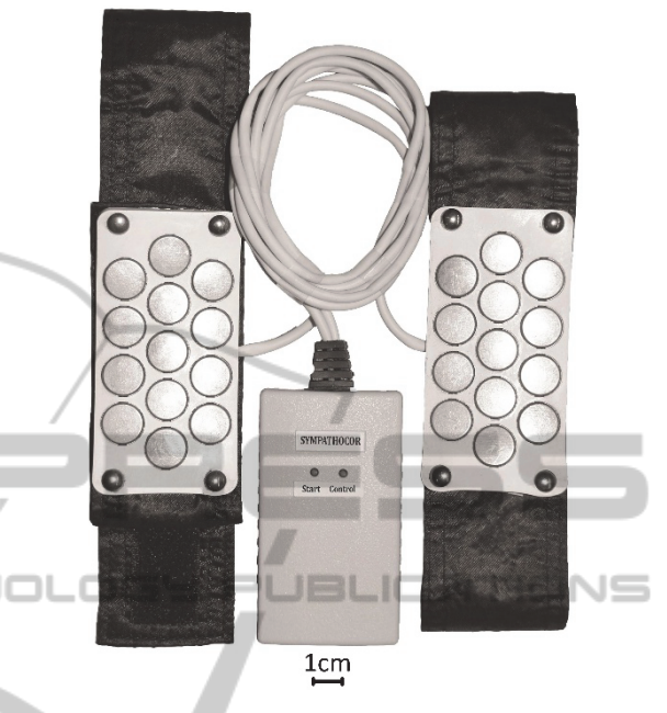
Figure 3: The general view of the SYMPATHOCOR device.

working state, the central element of one array plays the role of the anode. Electrodes on the other side become the cathodes. If it is necessary, the arrangement can be reversed in opposite direction.