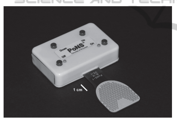
Figure 2: PoNS device.

The portable neuromodulation stimulator (PoNS<sup>TM</sup>) is an electrical pulse generator that delivers carefully-controlled electrical stimulation to the tongue. The pulses are generated and controlled by commercially available counter, timer, and wave-shaping electronic components. The components are mounted on a single printed circuit board (Fig. 2). The circuit board contains 143 gold-plated electrodes that contact the tongue. A rechargeable lithium-polymer battery with built-in charge safety circuitry provides the power.