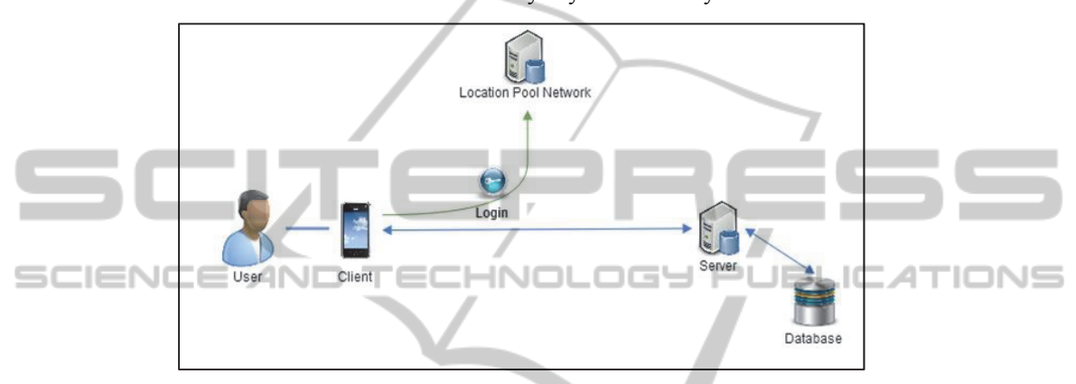
Fig. 3. System Software Architecture – It has a central server with a database, another server dedicated to deal with locations and a mobile client that may be replicated as needed.