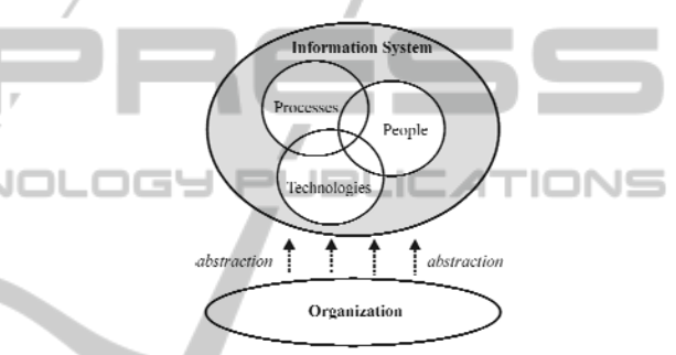
Figure 1: Information System as Sociotechnical System.

In this sense, as illustrated in Figure 1, people, processes and technologies are constituting elements of the information system of an organization: information in the organization is handled by people to run a set of organizational processes that contribute to the achievement of organization's objectives and to the fulfillment of organizational processes is supported and facilitated by the use of technologies.