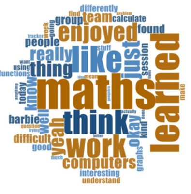
Figure 3: Word Cloud.

"I liked this week; it did not feel like maths in a way, it felt like fun. It felt different from school maths but I still learned things."