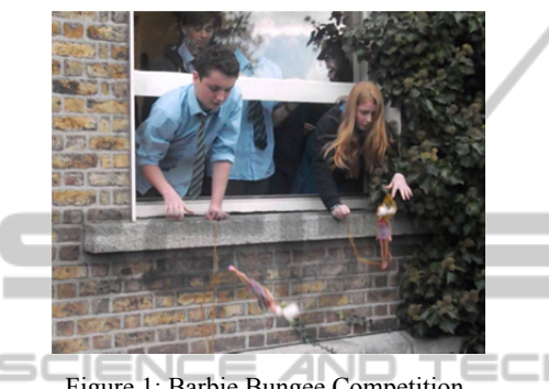
Figure 1: Barbie Bungee Competition.

Day 3 began with a very interesting discussion about functions, correlation, causality and extrapolation. The groups then estimated the distance the Barbie would need to drop from the first floor window and returned to the functions that described their line of best fit. Once the dolls were attached to their bungees, the knockout competition began and two by two the teams competed to see whose doll got closest to the ground without hitting it.