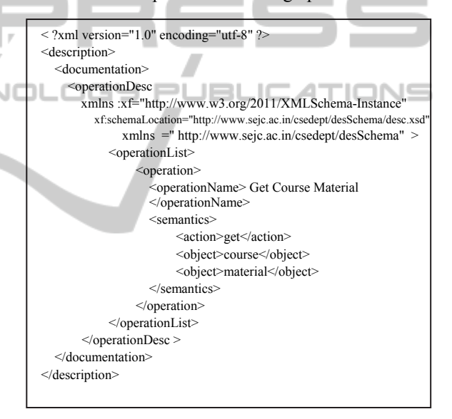
Figure 1: Example of a Web service learning.

publication of these services. This extension is composed of a set of new elements. The element "documentation" is chosen to include the information necessary for better service discovery in WSDL. The label entitled "operationDesc" is defined to insert the functional semantics of all operations present in the learning service. The new elements "operationList", "operation", "action", "call", "object" and "name" are used within the element "operationDesc". These new elements are defined in the XML schema that governs the structure of the extended documentation element. Functional semantics of a transaction are defined inside the element "semantics", the element is placed inside of the element "operation". Elements such as "action", "qualify", "object" and "not" are used in the element "semantics" that provides a functional description of a learning operation.