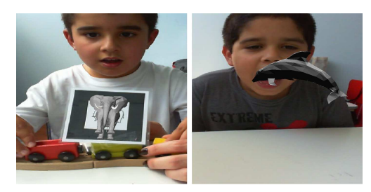
Figure 3: Children interacting with the prototype.

A qualitative study was performed with data gathered through observation by the team, including the therapist, in order to evaluate the suitability of the software usage by the children, namely what behaviours were triggered by the usage of AR, and if the children had benefited from the interaction with the software. To support the study we recorded the sessions in video, and filled observation grids with the interaction stages as well as observations that emerged in the sessions with the children (Figure 3).